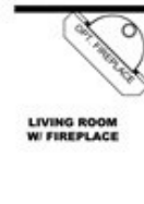
LIVING ROOM W/ FIREPLACE

Our home building facilities invest in continuous product and process improvements. Plans, dimensions, features, materials, specifications and availability are subject to change without notice or obligation. Renderings and floor plans are representative likenesses of our homes and may differ from the actual homes. We invite you to tour a Home Center near you and inspect the highest value in quality housing available or call (270) 443-6777 to speak with a Home Consultant. Copyright 2017,