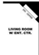
LIVING ROOM W/ ENT. CTR.