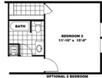
OPTIONAL 2 BEDROOM